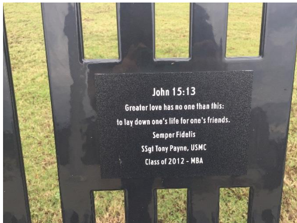
EXAMPLE BENCH PLAQUE (front)