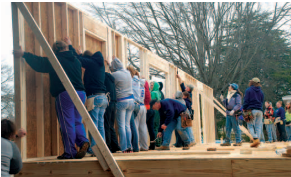
SWU's softball team helps build a Habitat for Humanity house in Liberty, S.C.